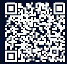
2020 Biometric Identification Award video