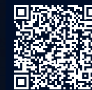
2018 Biometric Identification Award video

A detailed explanation of these cases are showcased with videos at https://fbibiospecs.fbi.gov and can be viewed by scanning the QR Codes below.